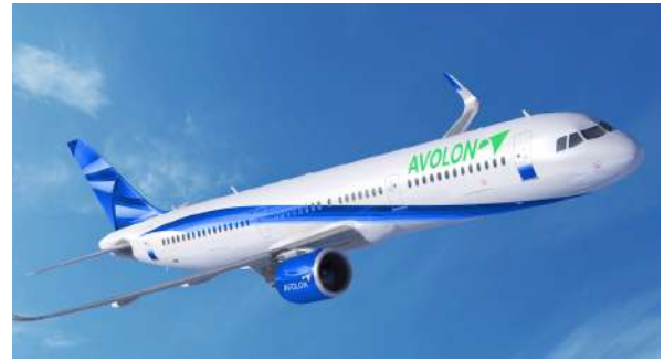
Avolon's A321

Aircraft lessor, Avolon has agreed to purchase a total of 140 new aircraft from Airbus and Boeing, including 100 Airbus A321neos and 40 Boeing 737 MAX 8 jets. Deliveries for these aircraft are expected up till 2032.