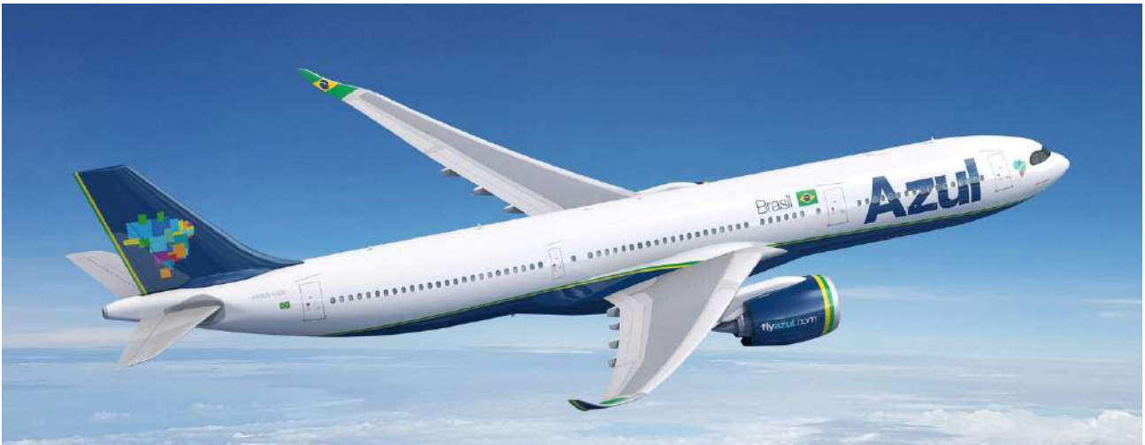
Azul adds on to A330neo order

Azul has added on to its order of A330neos, with a firm order for 4 additional A330-900s from a purchase agreement in June 2023. With these aircraft, the airline will expand its fleet and international route offering. These new aircraft will replace their 4 A330-200s and 2 A350-900s in their fleet.