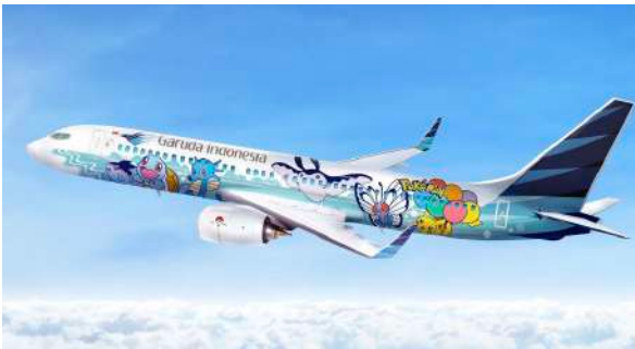
Garuda's Pokemon Jet