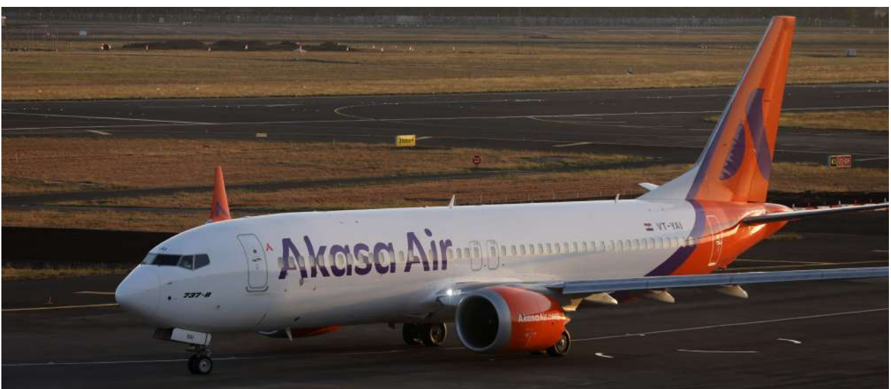
Akasa Air's 737 MAX

Nonetheless, the airline was previously granted rights to other destinations in Saudi Arabia, Kuwait and Qatar earlier in October, which could kickstart their international operations.