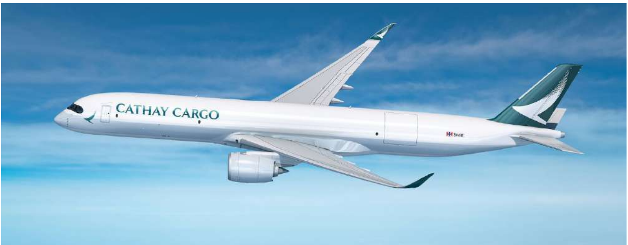
Cathay Cargo's new A350F