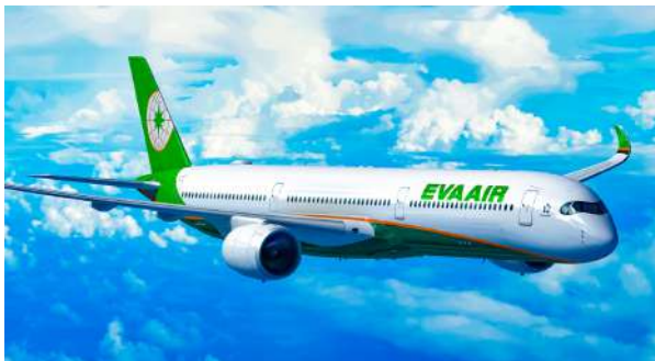
EVA Air's A350 Order