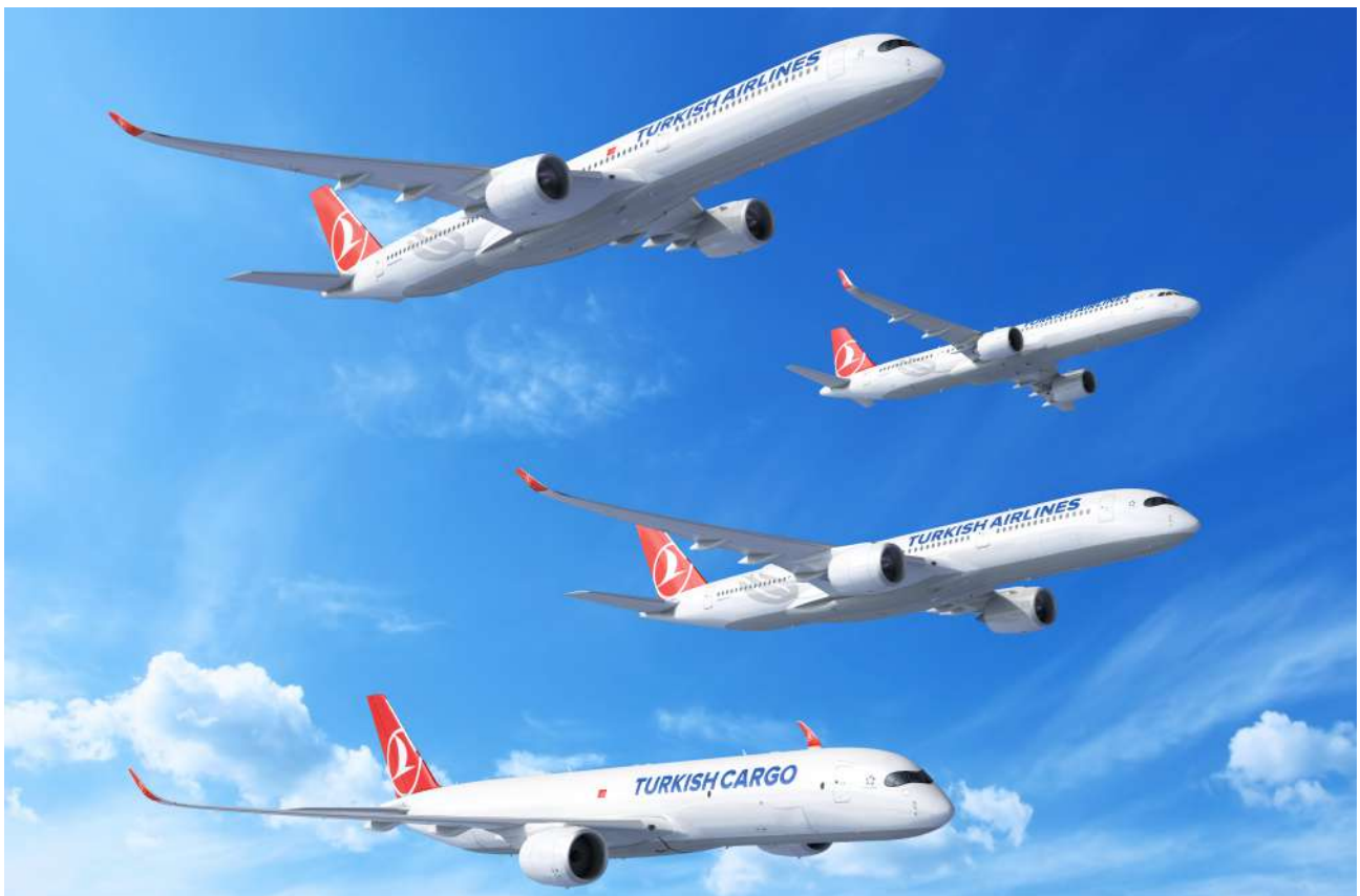
Turkish Airlines' Massive Airbus Order

Turkish Airlines has confirmed an order with Airbus for 220 new aircraft. This brand-new order consists of 150 A321neos, 50 A350-900s, 15 A350-1000s and 5 A350F (Freighters). This follows two orders from the airline for 10 A350-900s in September and four A350-900s in July 2023.