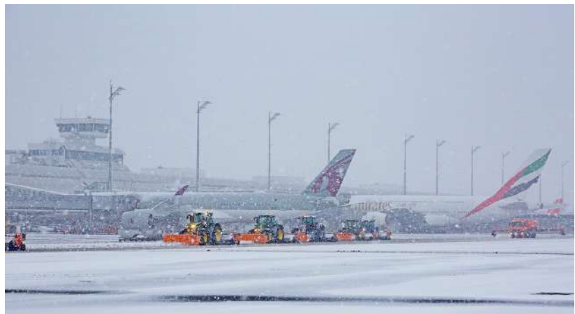
Munich Airport covered in snow

The final month of the year is notorious for its unstable weather causing disruptions across the world, especially in aviation. Just on the second day of the month, two airports were hit with severe snowy conditions which delayed, diverted and cancelled hundreds of flights. Due to “heavier than forecasted snow”, Glasgow airport shut down on 2 December from 7.24am to noon, and Munich airport was forced to close for nearly 24 hours that same day.