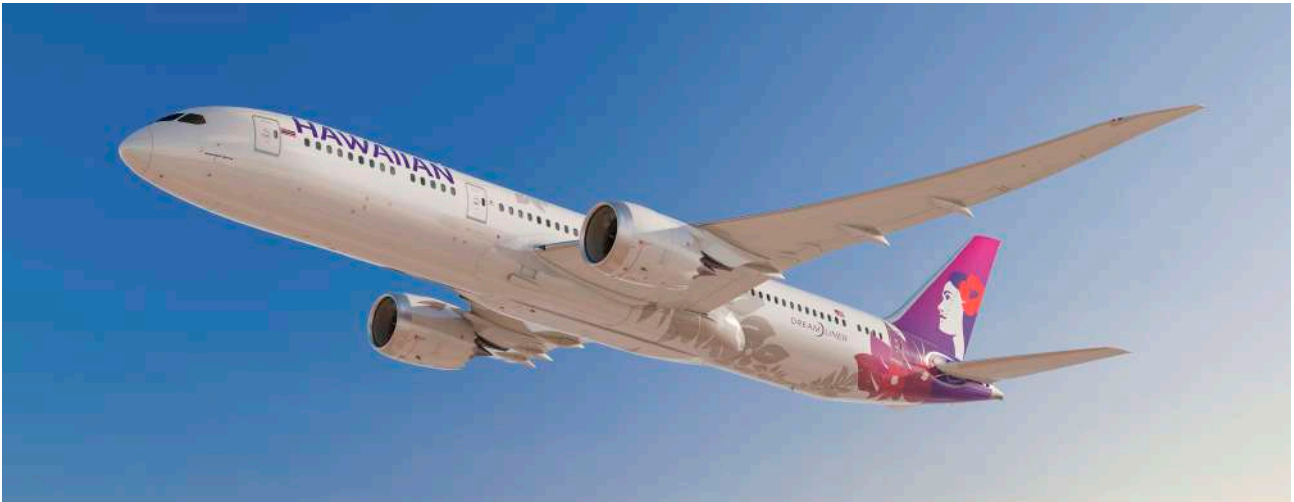
Hawaiian Airlines' new Boeing 787

Alaska Air Group- consisting of Alaska Airlines and regional carrier Horizon Air has announced the acquisition of Hawaiian Airlines in a deal worth USD 1.9 Billion- including around $900 million of Hawaiian Airlines' debt.